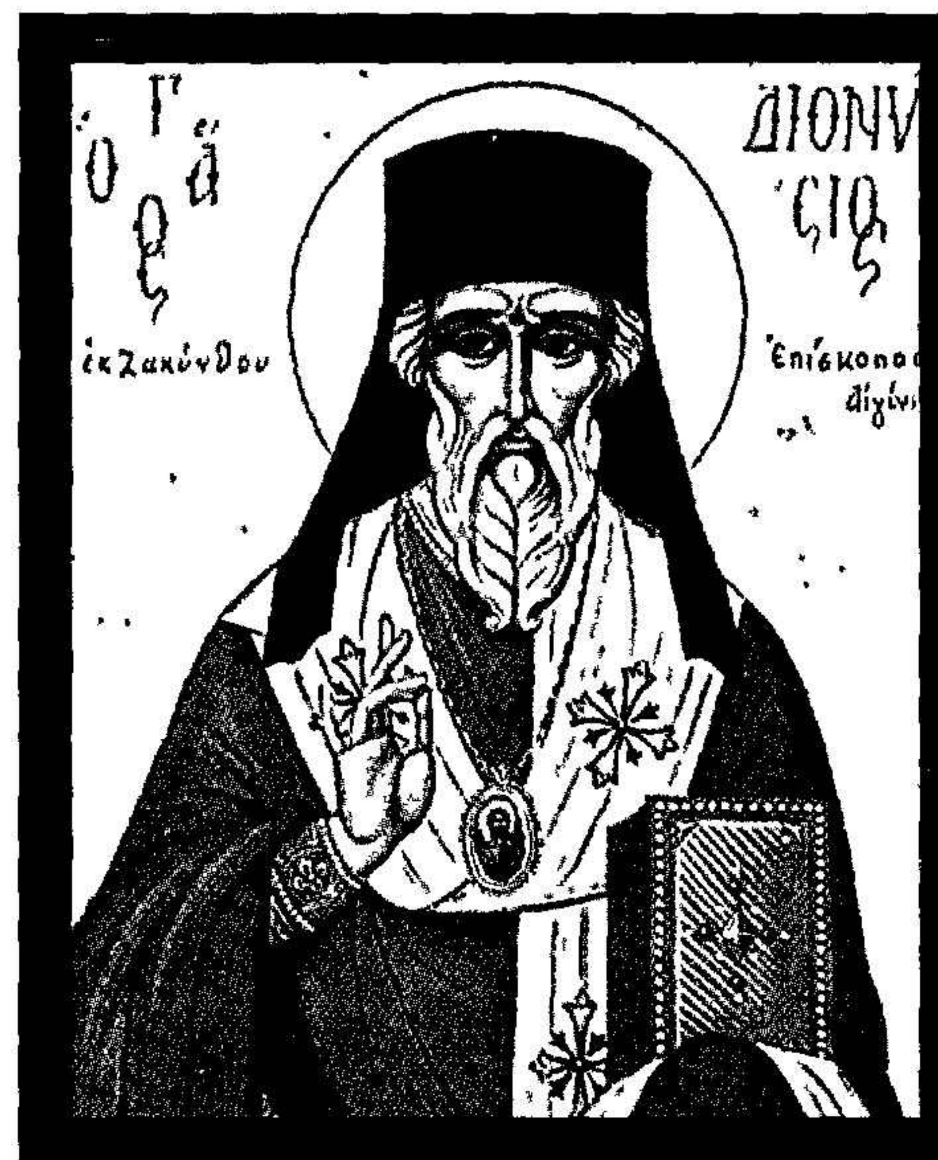
Saint Dennis of Zante 1547 – 1624 AD Canonized in 1703